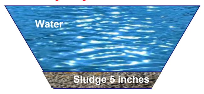
75% Reduction in Sludge Depth Since 2012